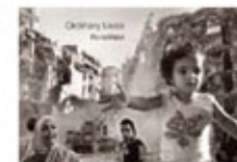
Rania Matar, Ordinary Lives. 128 pages; 100 duo tone images; 30 x 20.2 cm; The Quantack Lane Press

Lebanese-born photographer Rania Matar focuses her lens on the everydayness of women and children living in Lebanon. But her stunning black & white images show more than just lives in a country torn apart by war and suffering – Matar reveals the humanity and dignity to be found amongst the rubble, in the refugee camps and behind the veil of a heavily shuck country. 'Ordinary Lives', a touching book by a great Leica photographer.