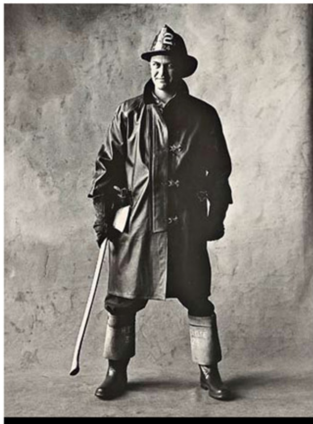
Irving Penn: Fireman, New York, 1951 © 1951, renewed 1979 Corbis Nast Publications, Inc.