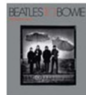
Beatles to Bowie. The London 60s. 208 pages; 300 images in duo tone and colour; 25 x 28 cm; National Portrait Gallery Publications