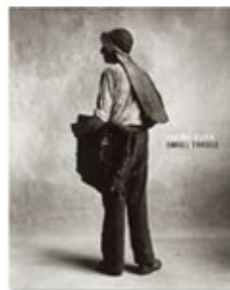
Irving Penn, Small Trades. 259 tri tone images, 272 pages, 31.2 x 25.1 cm, Getty Publications

The exhibition, titled 'Small Trades', presents typological pictures of craftsmen and workers photographed in a studio using natural light. For the first time the series can be seen in its entirety. The corresponding book showcases the complete collection of 252 black & white images, depicting working men and women removed from context yet complete with the many characteristics of their trade. Penn suspected at the time that many of the vocations were slowly dying out. In his portraits, however, they live on.