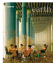
Earth, Prix Pictet 2009. 128 Pages; 80 images in black & white and colour; 26 x 32.5 cm, TeNeues