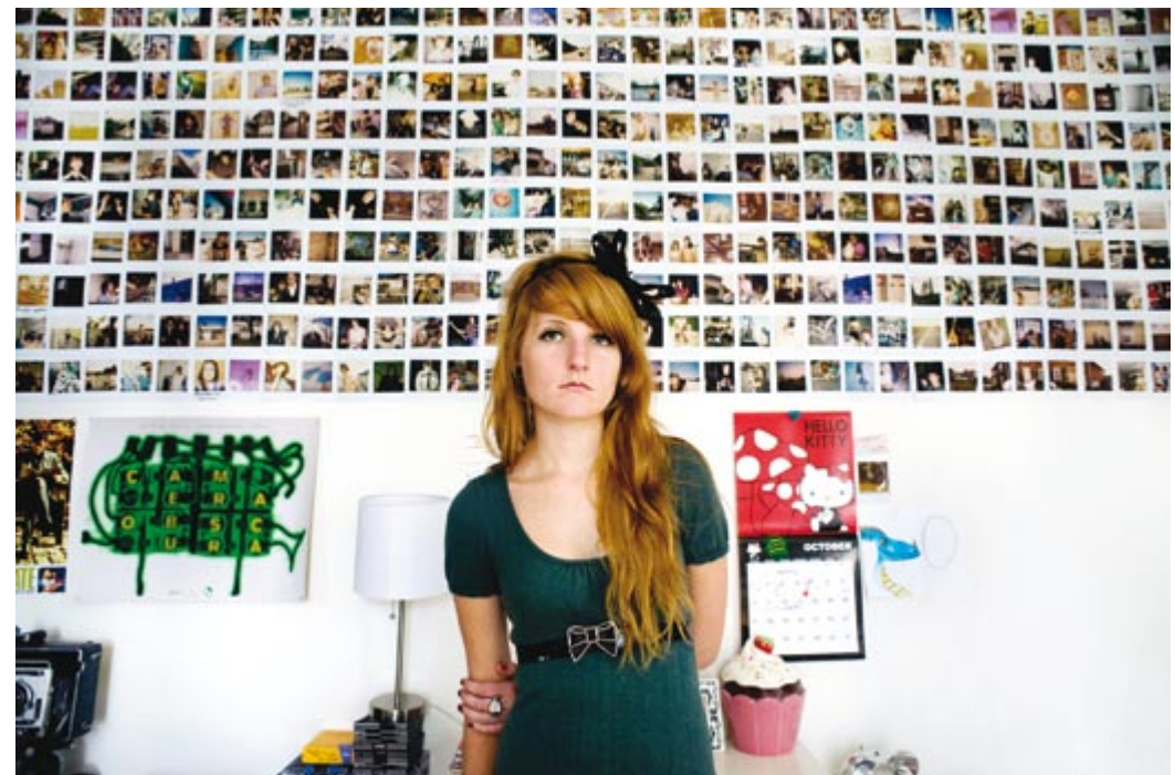
Ellice 20, Jamaica Plain MA. Archival pigment print, 2010. 71cm x 107 cm