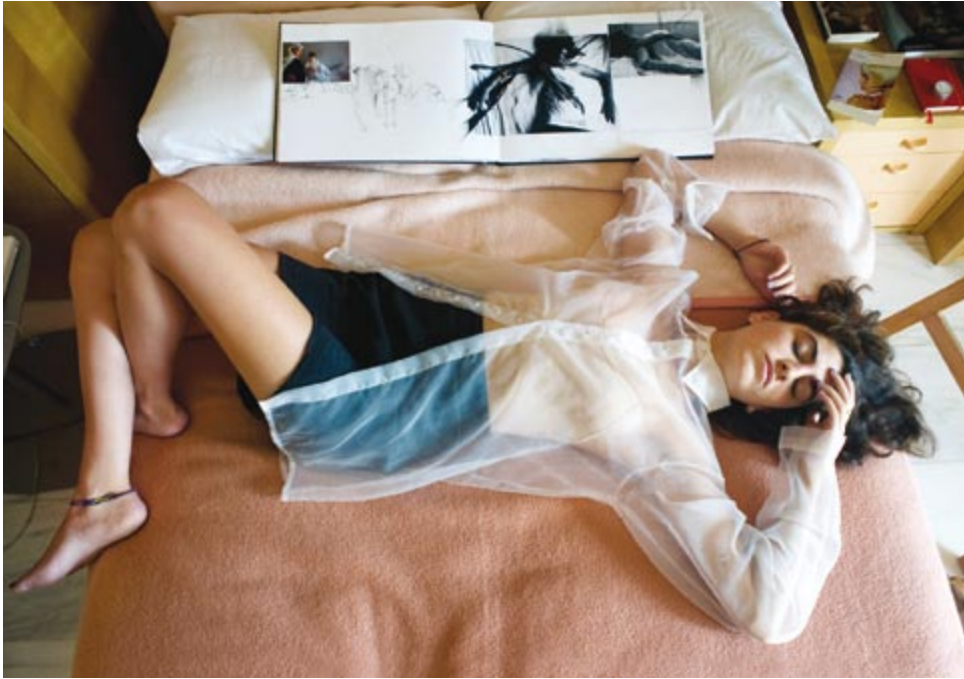
Reem 19 - Lebanon. Archival pigment print, 2010. 71cm x 107 cm