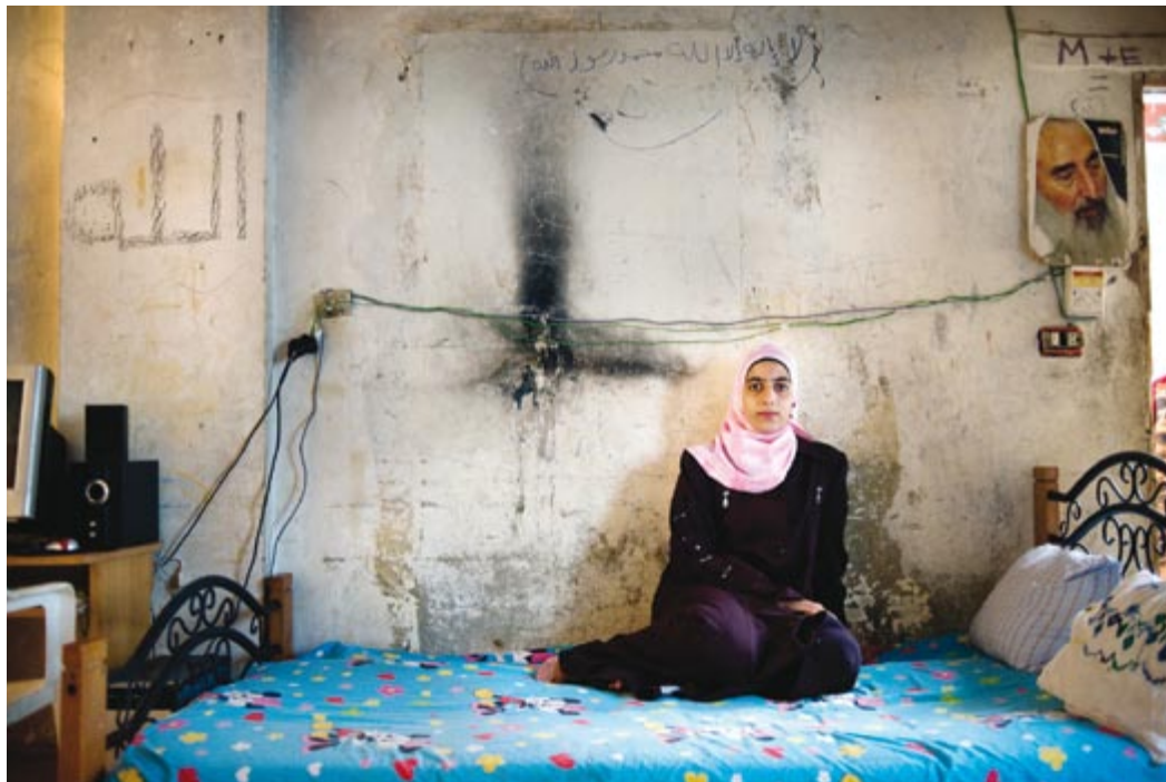
Elham 18 - Shatila, Beirut. Archival pigment print, 2010. 71cm x 107 cm

Exhibition open Mon-Fri 11-6pm, Sat 11-4pm