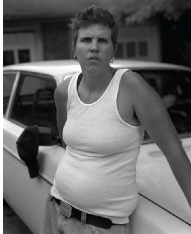
JESS T. DUGAN (Cambridge, MA), Nikki , 2006, Gelatin silver prints, 20 x 16 inches

"A Girl and her Room" focuses on teenage girls in the privacy of their own rooms, often the only space which they fully control and reflects their personalities best. www.raniamatar.com