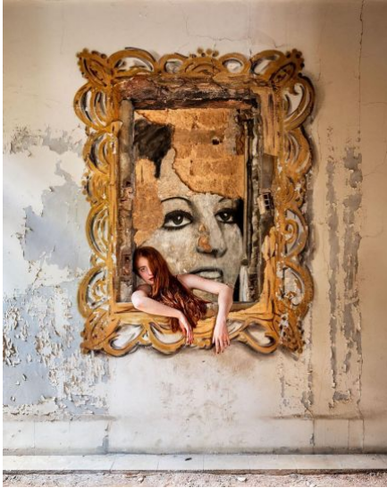
Petra with Miss Lebanon 1972, Gemmayze, Lebanon, 2022 (wall art by Brady Black) © Rania Matar- Courtesy of the artist and Fitchburg Art Museum