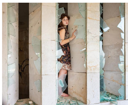
Demi, Broken Glass, Brummana, Lebanon, 2021 © Rania Matar- Courtesy of the artist and Fitchburg Art Museum