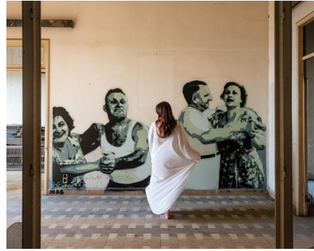
Aya (Dancing), Beirut, Lebanon, 2022 (wall art by Nab)