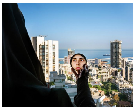
Alae (with the Mirror), Beirut, Lebanon, 2020