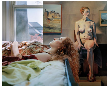
MollyKate, Allston, Massachusetts, 2018

Create an account or log in to read more and see all pictures.