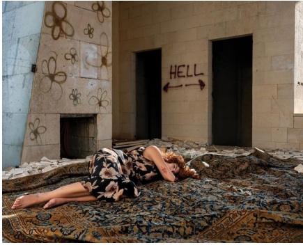
Yasmina (Hell), Brummana, Lebanon, 2022 © Rania Matar- Courtesy of the artist and Fitchburg Art Museum

Create an account or log in to read more and see all pictures.