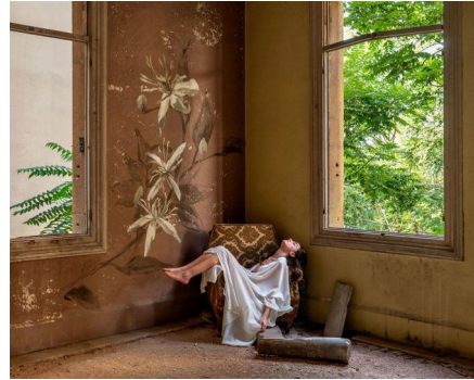
Aya (Draping), Gemmayze, Beirut, Lebanon, 2022