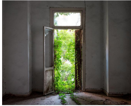
Open Door, Beirut, Lebanon, 2022

Create an account or log in to read more and see all pictures.