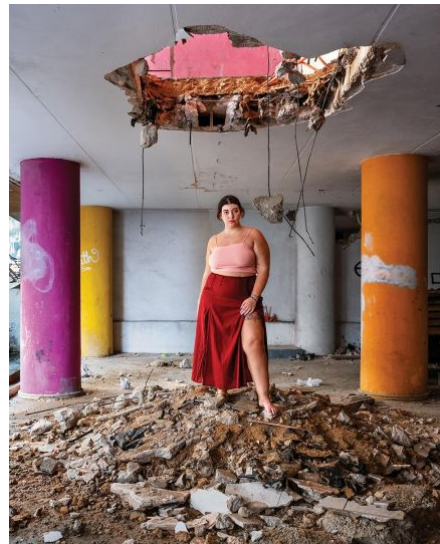
Chermine, Hamra, Beirut, Lebanon, 2022 © Rania Matar- Courtesy of the artist and Fitchburg Art Museum